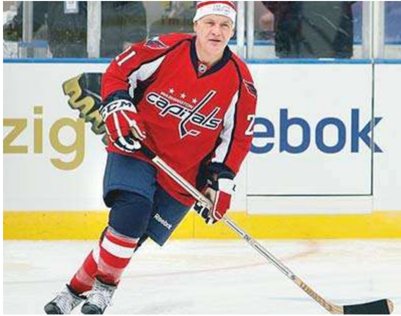
Dennis Maruk plays in a Washington Capitals Alumni game in 2012.

MARUK MOMENTS: He was the 21st overall selection in the 1975 NHL Draft. Born on November 15, 1955, in Toronto, at young age he watched the Maple Leafs on TV's "Hockey Night in Canada." The first famous hockey player he met was Bobby Hull at a practice at Maple Leaf Gardens while with the Marlies (he was then 12 years old). After he tore his knee ligament (MCL), he missed an entire year (1978-1979) with Minnesota. Maruk was very frustrated with not making the playoffs and playing on losing teams. His most memorable goals: first-ever goal against Wayne Thomas in Toronto while with the Seals and his 60th against Montreal. His closest friend in the NHL was fellow Ukrainian Brian Bellows in Minnesota. Maruk's toughest competitors to play against were Bryan Trottier and Mark Messier. He like to play tennis and golf, and respects people who deal with adversity and challenge themselves to overcome it. He also believes passion is essential in life. Maruk was elected to Ukrainian Sports Hall of Fame in September 2018.