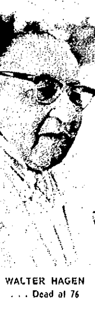
WALTER HAGEN ... Dead of 76