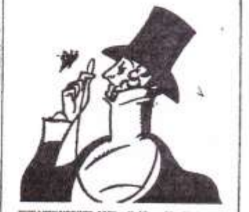
THE NEW YORKER, 25 West 43rd Street, New York, New York 10018. Other advertising offices: Chicago, San Francisco, Los Angeles, Atlanta, London.

Distillers Co., Ltd. has been advertising Gordon's Gin in The New Yorker for 36 years.